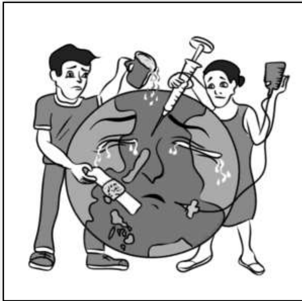
Illustrated by: Jerson Rod A. Acosta

Directions: Analyze the picture below. Take note of the different symbols and how they were put together to show a message. Share your interpretation of the picture by answering the following questions: