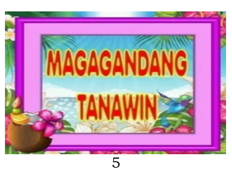
Illustration \ sources: Comicscube.com \\ 365 greatpinoystuff.wordpress.com \\ Redbubble.com